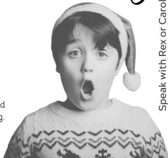
Speak with Rex or Carol

Therefore encourage one another and build each other up, just as in fact you are doing. 1 Thessalonians 5:11